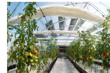
Agriculture Integrated Organic Photovoltaics (Agri-PVs)