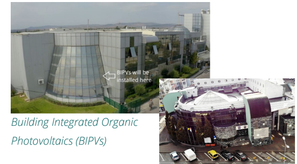
Building Integrated Organic Photovoltaics (BIPVs)