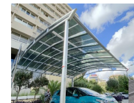
Vehicle Integrated Organic Photovoltaics (VIPVs)